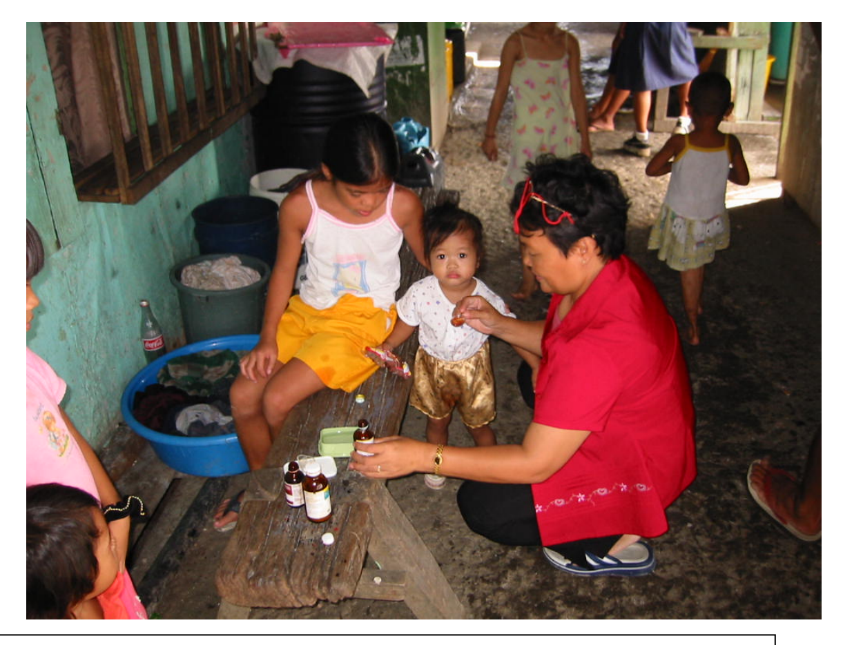
A "bodega binhi" mini-pharmacy gives free medicine to children with tuberculosis in Tondo, Manila