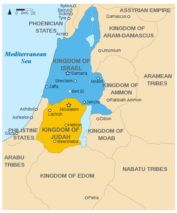
Image from Wikimedia Commons, Oldtidens Israel & Judea.svg http://www.jewishvirtuallibrary.org/map-of-israel-and-judah-733-bce

Their interpretation of Obadiah 1:18 which predicts the destruction of Edom is both exegetically and historically incorrect. This prophecy was fulfilled under Judas Maccabeus and/or John Hyrcanus and does not apply today. See the two commentators below, from their notes in E-Sword Bible software: