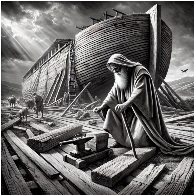
Noah Builds the Ark, generated by ChatGPT March 2025